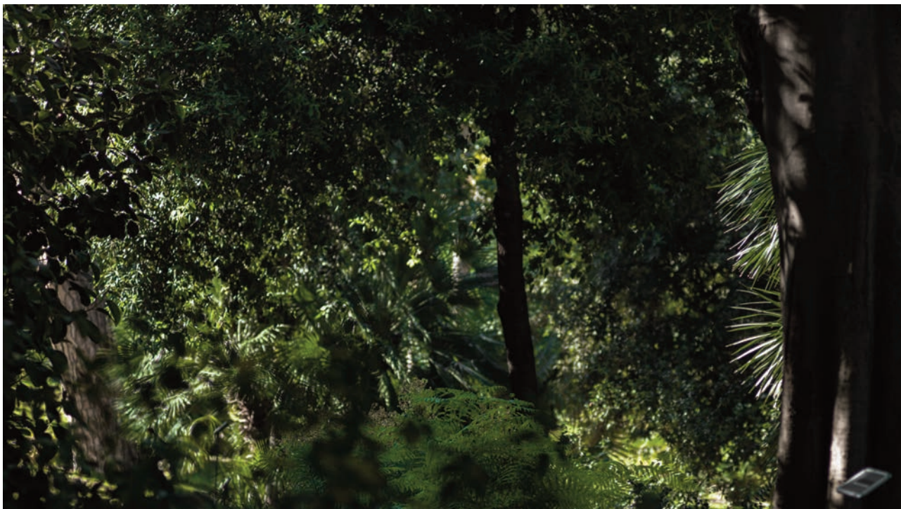
CAPTION MELIK OHANIAN Stuttering, 2014, Animated photographs. 69x122cm. Courtesy of the artist and Chantal Crousel Gallery © Melik Ohanian